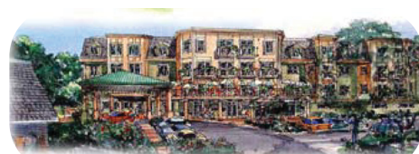
Senior Living Community

"Providing dignified, affordable homes for those who need a helping hand"