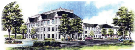
Assisted Living Community